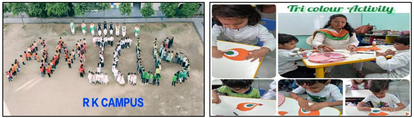
take home Tricolour activities made by them in school.

On account of REPUBLIC DAY , the school organized ' Tricolour Day ' for the children on 24<sup>th</sup> January, 2024 to instill within the children the spirit of patriotism. The vibrancy of the Indian flag - Tricolour, could be experienced through hands-on craft activity by our munchkins. All the children worn Tricolour attire. Children sang the National Anthem & saluted the National Flag. The children were thrilled to