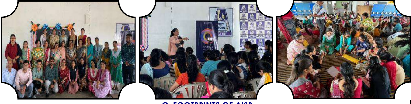
C: FOOTPRINTS OF AISB

Our 24 Teachers attended a Training Programme on the Topic "Competency-Based Learning ", which was organised on 2<sup>nd</sup> October, 2023 at our Amity School. It was a great learning experience for them.