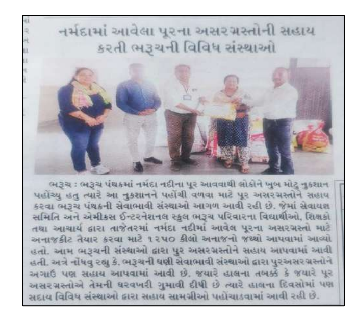
"Various institutions extended their helping hand for the Narmada flood affected people" Published in Sandesh News dated 22nd October, 2023