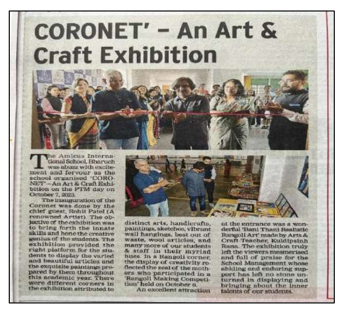
"CORONET – An Art & Craft Exhibition at AMICUS" Published in Times of India (NIE Edition) dated 12th October, 2023