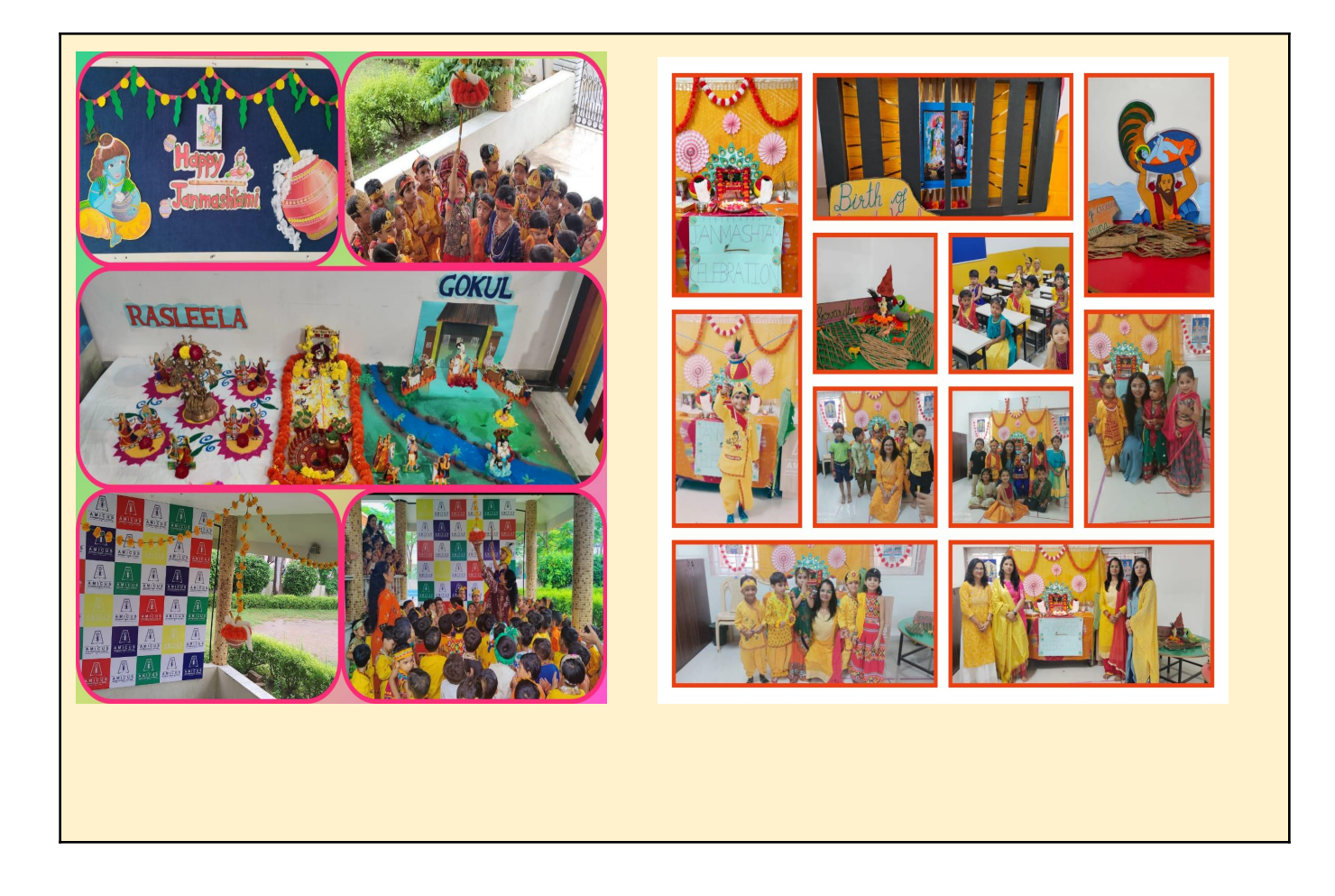
FOR, AMICUS INTERNATIONAL SCHOOL BHARUCH