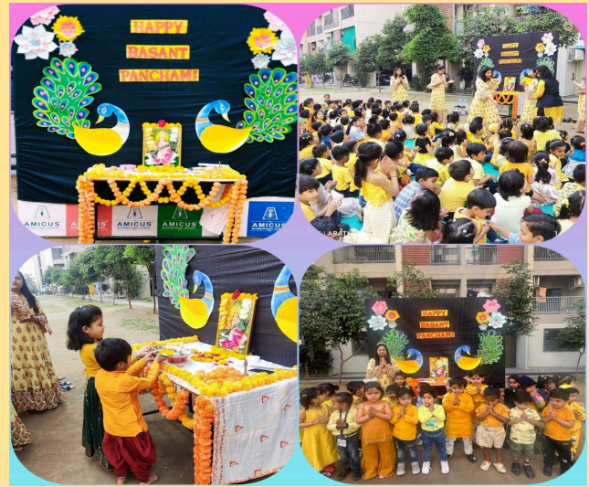
Vasant Panchami Celebration