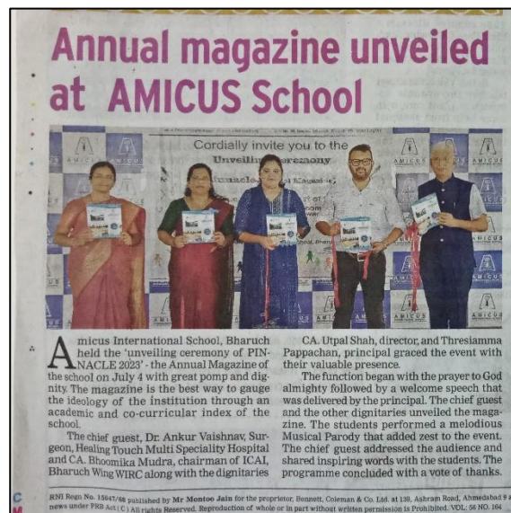
Annual Magazine Unveiled at AISB Published in Times of India (NIE Edition) dated 13 th July, 2023