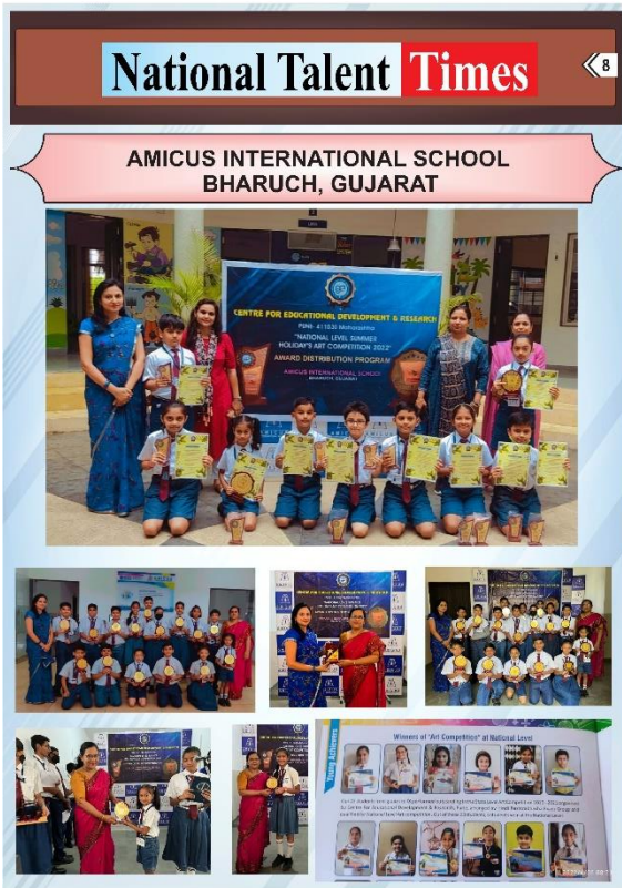
AISB Winners in 'National label art competition' Published in National Talent Times, Volume-15, Issue-5