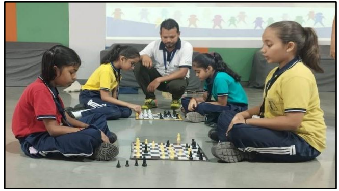
TABLE TENNIS / CHESS COMPETITION – G6 TO G8 : 18 TH JULY, 2024