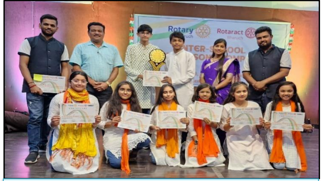
Patriotic Songs Competition, Rotary Club of Bharuch AISB Team secured 2 nd Position in the Inter-school Patriotic Song Competition organised by the Rotary Club of Bharuch.