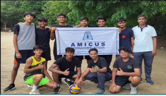
Volleyball Competition, SGFI (Taluka Level) AISB Girls Volleyball Team emerged as the Runners-up in the Volleyball Competition, U-19.