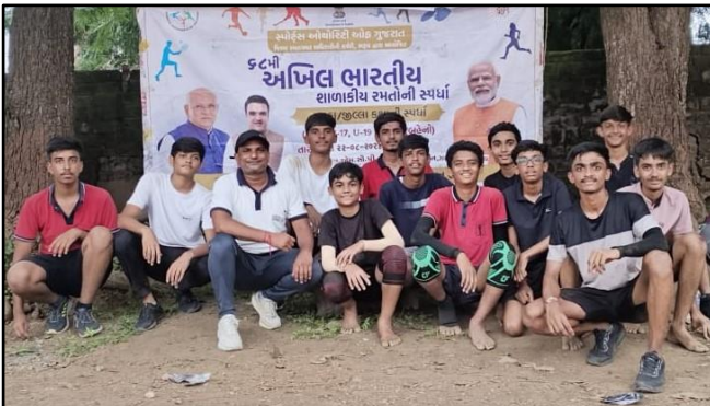
Kho Kho Competition, SGFI (Taluka Level) AISB Boys Kho Kho Team secured 2 nd Position in the Kho Kho Competition, U-17.