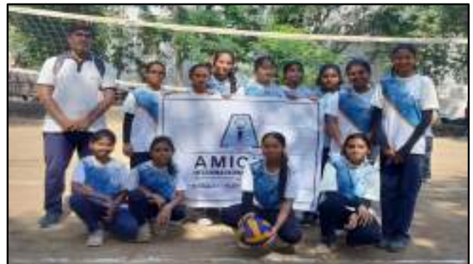
Khel Mahakumbh Taluka Level Volleyball Competition AISB U14 Girls Team secured runners-up position in the Volleyball Competition at Taluka Level Khel Mahakumbh & qualifying for the District Level Championship .