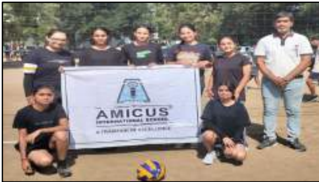
Taluka Level Khel Mahakumbh Volleyball Competition AISB Girls Team secured runners-up position in the Volleyball Competition at Taluka Level Khel Mahakumbh & Secured 3 rd Position in District Level Championship . Category: Open