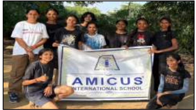
SGFI Zonal Level Kho-Kho Competition AISB U17 Girls Team secured 3 rd Position in the SGFI Zonal Level Kho-Kho Competition.