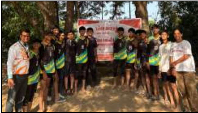
SGFI Zonal Level Kho-Kho Competition AISB U17 Boys Team secured 2 nd Position in the SGFI Zonal Level Kho-Kho Competition.