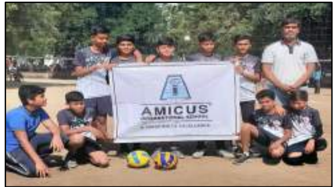
Taluka Level Khel Mahakumbh Volleyball Competition AISB U14 Boys Team secured runners-up position in the Volleyball Competition at Taluka Level Khel Mahakumbh & qualifying for the District Level Championship .