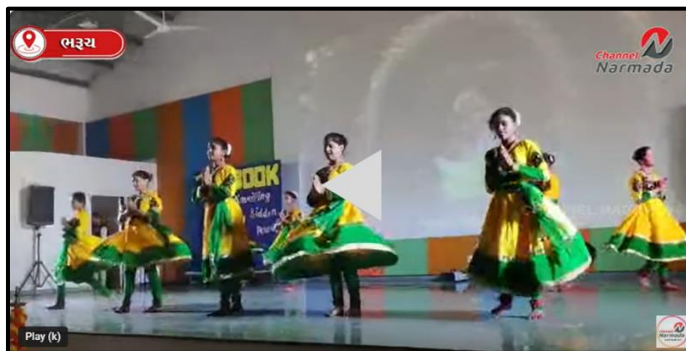
Annual Function, Melange 2024 organised by AISB Video published in Narmada Channel YouTube dated 2 nd December, 2024