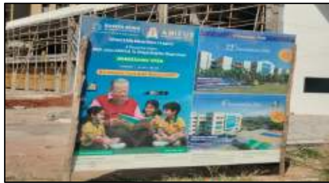
R.K. Celestial, Tavra Road.

We are delighted to announce that Amicus International School will soon be launching its new Pre-Primary Branch, Ruskin Bond International School marking a significant step forward in nurturing young minds.