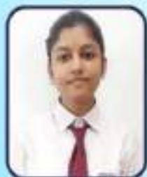
ISHIKA 94.8 %