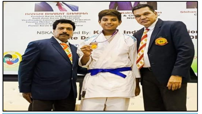
State Shotokan karate championship karate championship.